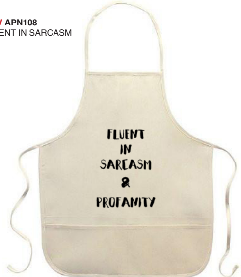
NEW APN108 FLUENT IN SARCASM