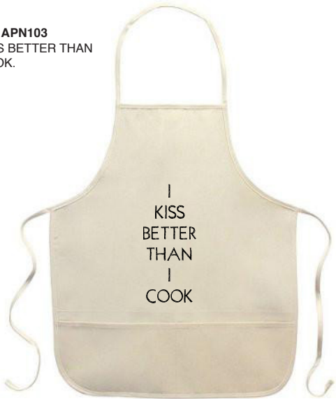
NEW APN103 I KISS BETTER THAN I COOK.