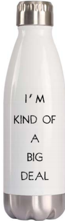
NEW WB110 I'M KIND OF A BIG DEAL