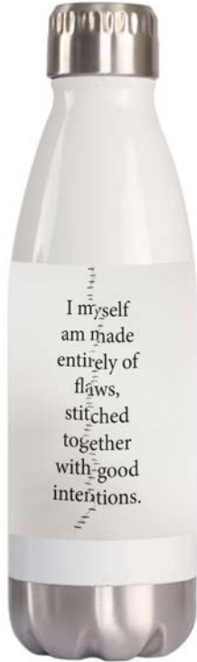
NEW WB111 Flaws (Graphic)