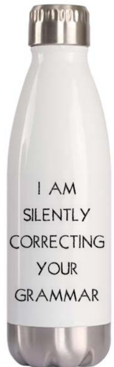
NEW WB100 I Am Silently Correcting your Grammar