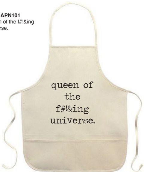
NEW APN101 queen of the f#!&ing universe.