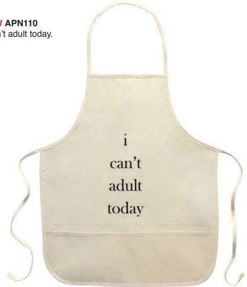
NEW APN110 I can't adult today.