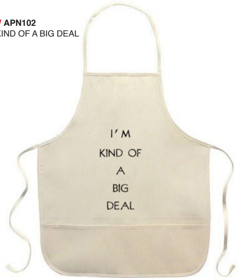
NEW APN102 I'M KIND OF A BIG DEAL