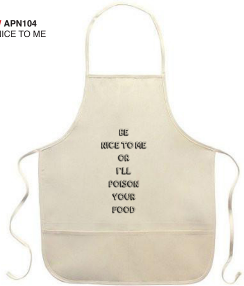
NEW APN104 BE NICE TO ME OR I'LL POISON YOUR FOOD