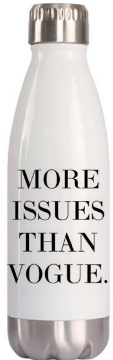
NEW WB106 More Issues Than Vogue