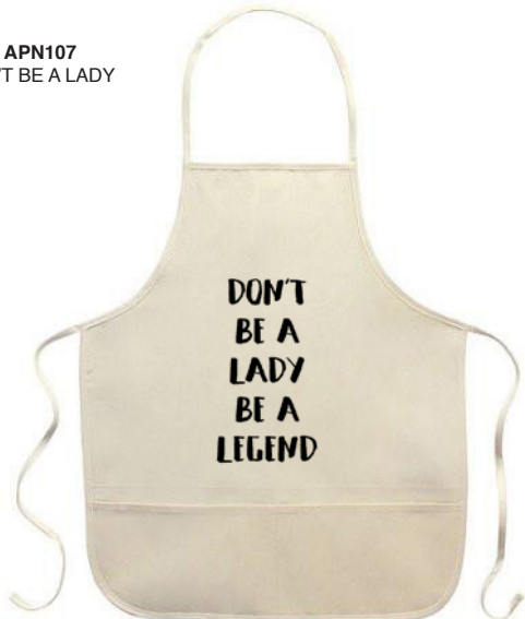
NEW APN107 DON'T BE A LADY