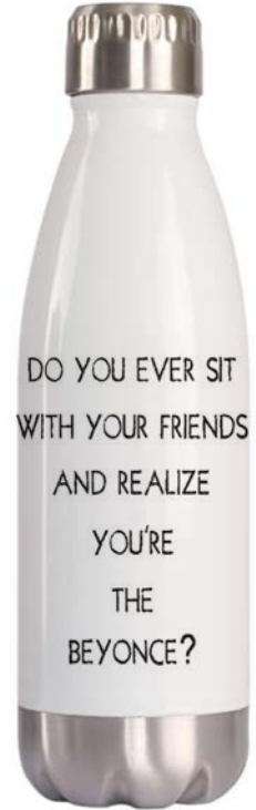
NEW WB109 Do you ever sit w/ your friends and realize you're the Beyonce?