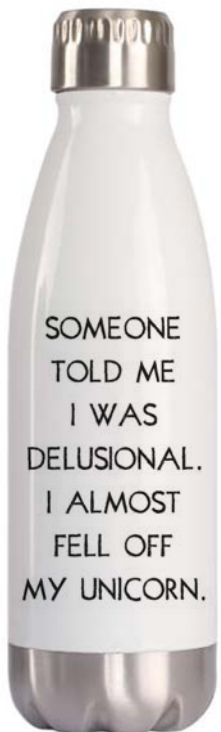
NEW WB102 Unicorn