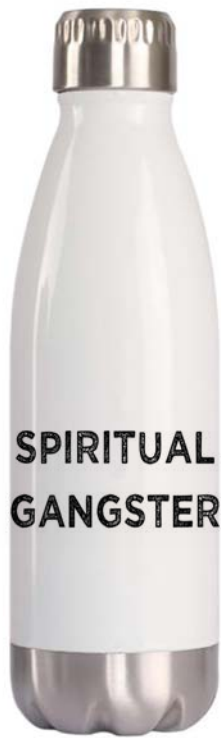
NEW WB105 Spiritual Gangster