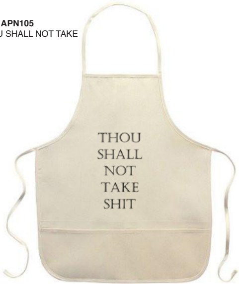
NEW APN105 THOU SHALL NOT TAKE SHIT