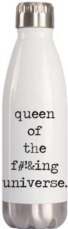
NEW WB108 queen of the f#!&ing universe.