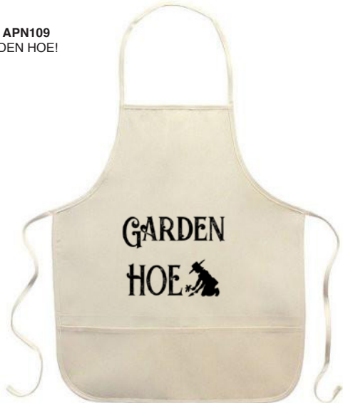
NEW APN109 GARDEN HOE!