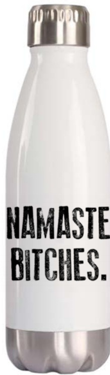
NEW WB104 Namaste Bitches