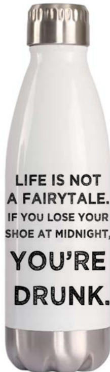
NEW WB107 LIFE IS NOT A FAIRYTALE IF YOU LOSE YOUR SHOE AT MIDNIGHT, YOU'RE DRUNK.