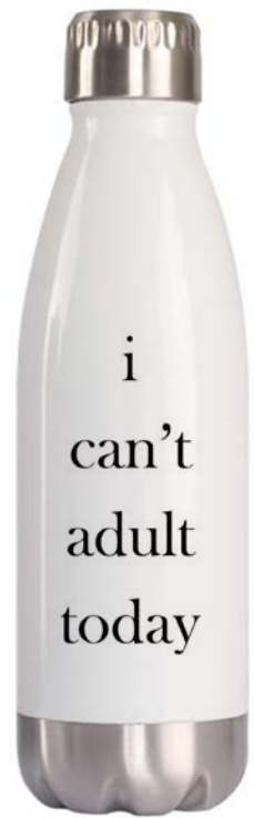
NEW WB103 I can't adult today.