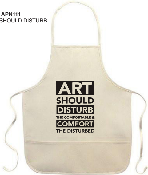
NEW APN111 ART SHOULD DISTURB