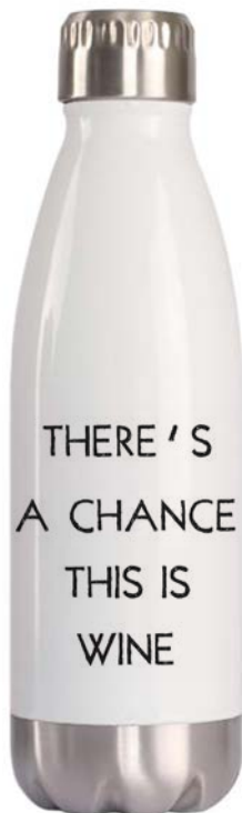
NEW WB101 There's a chance this is Wine